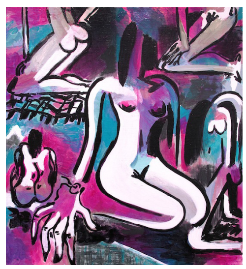
Mira Dancy, Window Poses, 2014. Acrylic on canvas, 21" x 19".