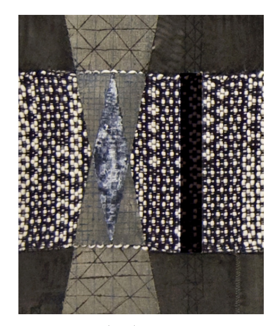
Julia Bland Untitled, (Detail) 2014, Oil, canvas, silk, wool and linen yarns, 86" x 85"