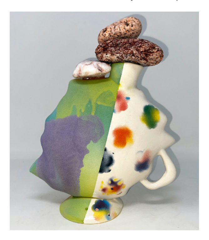
The Vase That looks like a Bus Seat, 2020 Ceramic 17,7 \times 17,7 \times 5 cm 7 \times 7 \times 2 in. Unique piece

Art Show, Dolhouse Gallery, Philadelphia