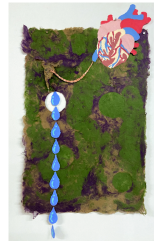
Cindy Cheng Untitled, 2021 Hand-made kozo paper, paper pulp painting, copper 41h x 22w in